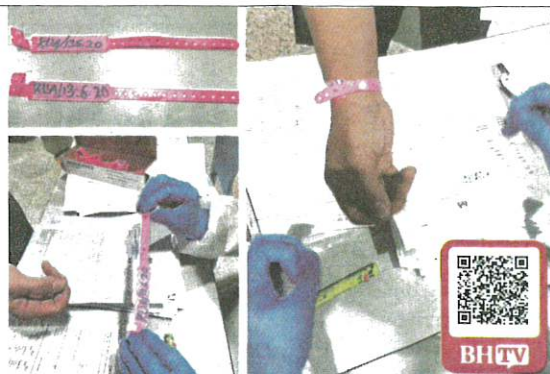
Gelang tangan yang dikeluarkan KKM perlu dipakai semua pengembara yang pulang ke Malaysia.

"Pastikan anda tidak berkongsi peralatan peribadi dengan ahli keluarga yang lain. Ahli keluarga bagi individu yang menja-