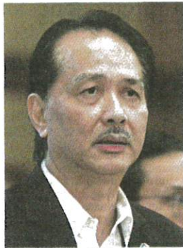
Datuk Dr Noor Hisham Abdullah

"This order falls under the Prevention and Control of Infectious Diseases Act 1988 (Act 342), where if people were found to have violated the ruling, they could face action under Section 24," he said at the daily press con-